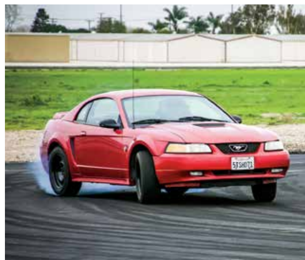
Clockwise from right: Bridgestone Winter Driving School; Badlands Off-Road Adventures; Bobby Ore Motorsports Stunt Driving; Bondurant School of High Performance Driving.